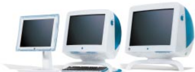
Nothing works and looks better with a new Power Macintosh G3 computer than an Apple Studio Display (sold separately).